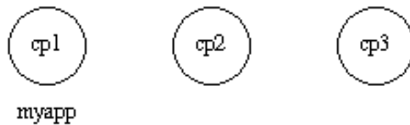
Figure 9.1: Application myapp - Situation 1

Similarly, the application must be stopped by calling application:stop(Application) at all involved nodes.